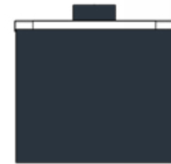
Capacity: 10 Gal