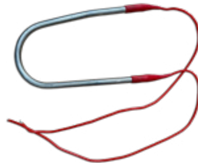
250W Heating Element