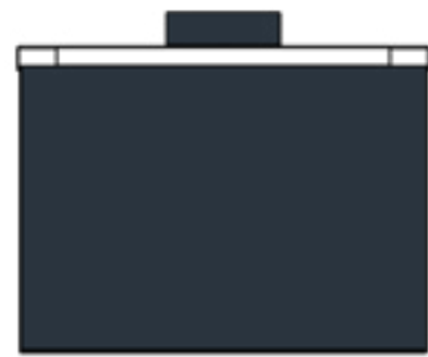
Capacity: 16 Gal.