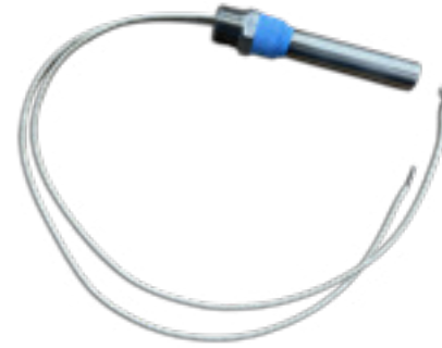
Adjustable thermostat Factory set at 45 Degrees Fahrenheit