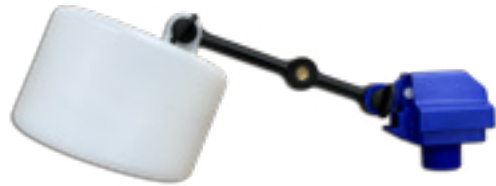
Monticello Float and Valve Assembly - Standard 1/4" Orifice available in 1/8", 1/4" or .45"