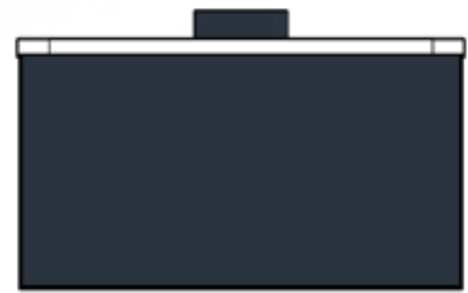
Capacity: 28 Gal.