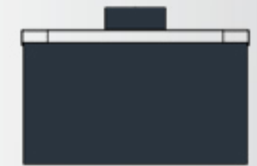
Capacity: 10 Gal