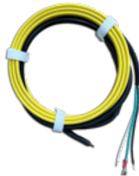
8' Heating Cable and tape to secure it to incoming water line