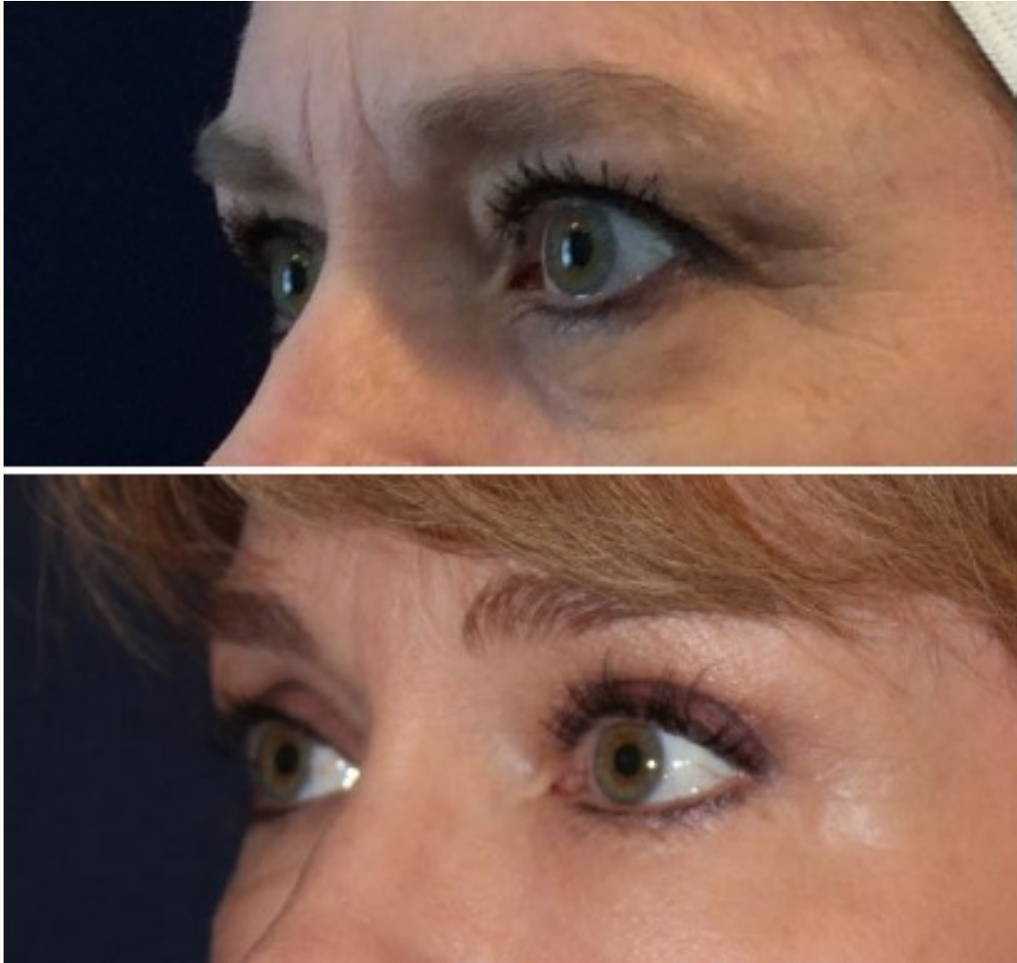
Case 2: 54-year-old Female BEFORE & AFTER Open Brow Lift and Lower Blepharoplasty

Droopy brows, deep furrows, and excess eyelid skin can make a happy person appear tired, angry, or “uninviting.” The periorbital region is delicate and demands an experienced surgeon’s hand. If done improperly, results can actually worsen the problem. For example, in patients with drooping brows, removing upper eyelid skin alone (upper blepharoplasty) can make brow heaviness more pronounced. Correcting the brow position first is often essential for a natural, long-lasting result.