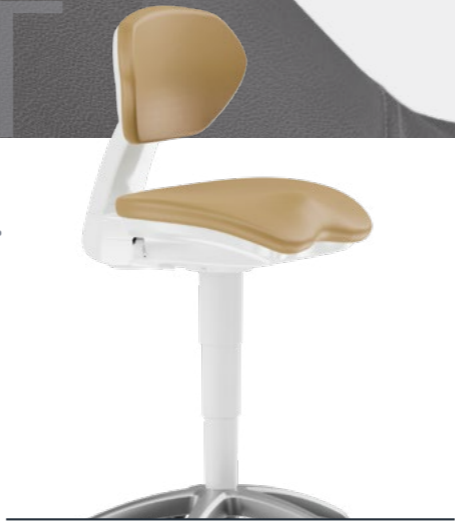
KaVo PHYSIO also available in Graphite and Cashmere, without memory foam and designer stitching.