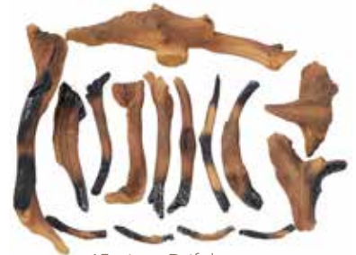
15-piece Drift log