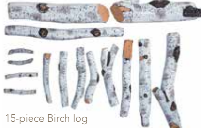
15-piece Birch log