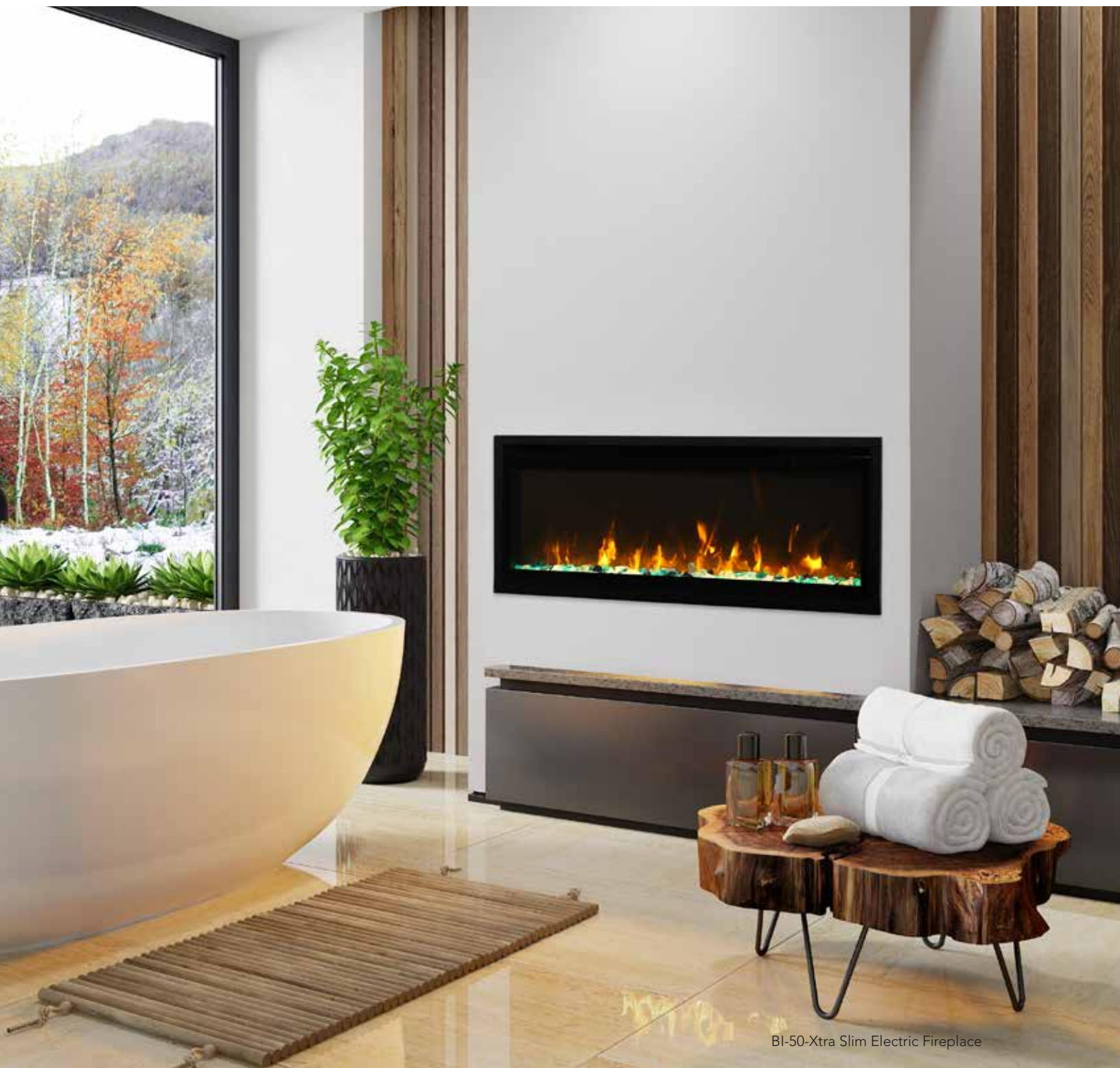
BI-50-Xtra Slim Electric Fireplace