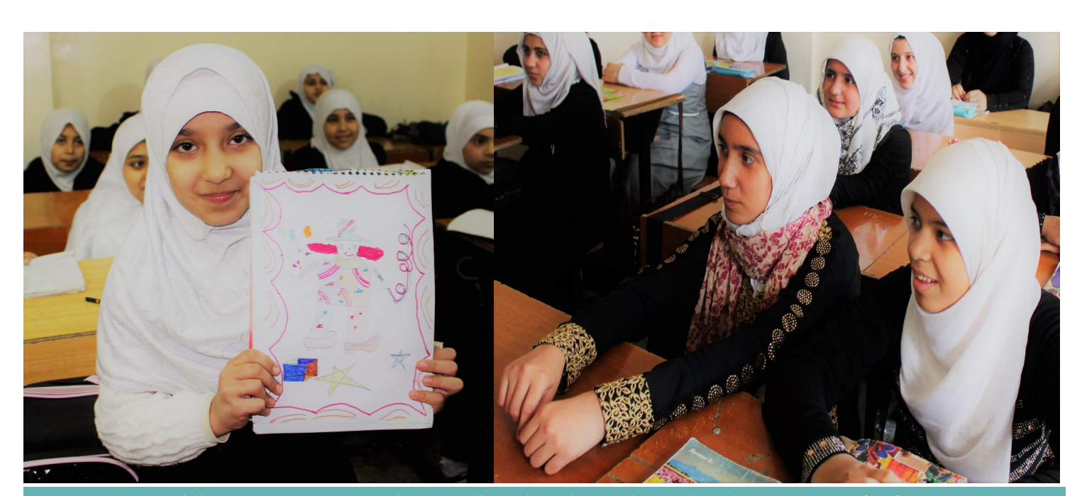
Providing Young Women with a quality education and ensuring them a successful future.

Contact Us 7944 N. Maple #115 Fresno, CA 93720 (559) 322-4852