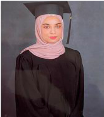
Zahra Hatim Pharmacy