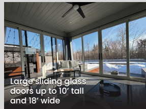
Large sliding glass doors up to 10' tall and 18' wide

As Regina's premier Duxton dealer, we supply, install and service fiberglass window and doors for new construction, remodels and window and door replacements.