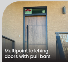
Multipoint latching doors with pull bars