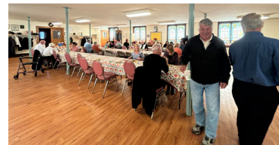
Photos from Harvest Dinner Above: Many enjoying the meal. Below: Crew working on preparing the meal. Thank you to all!