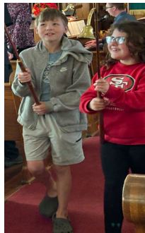
Photo of church Choir.