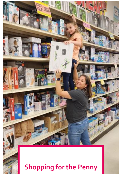
Shopping for the Penny Party