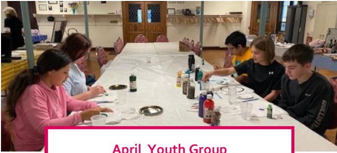
April Youth Group