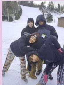
Having fun at the tubing event.