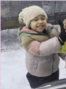
Putting on those warm gloves