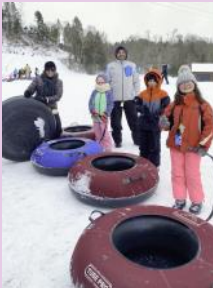
Getting ready to go tubing