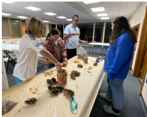
Photo from January Youth Group