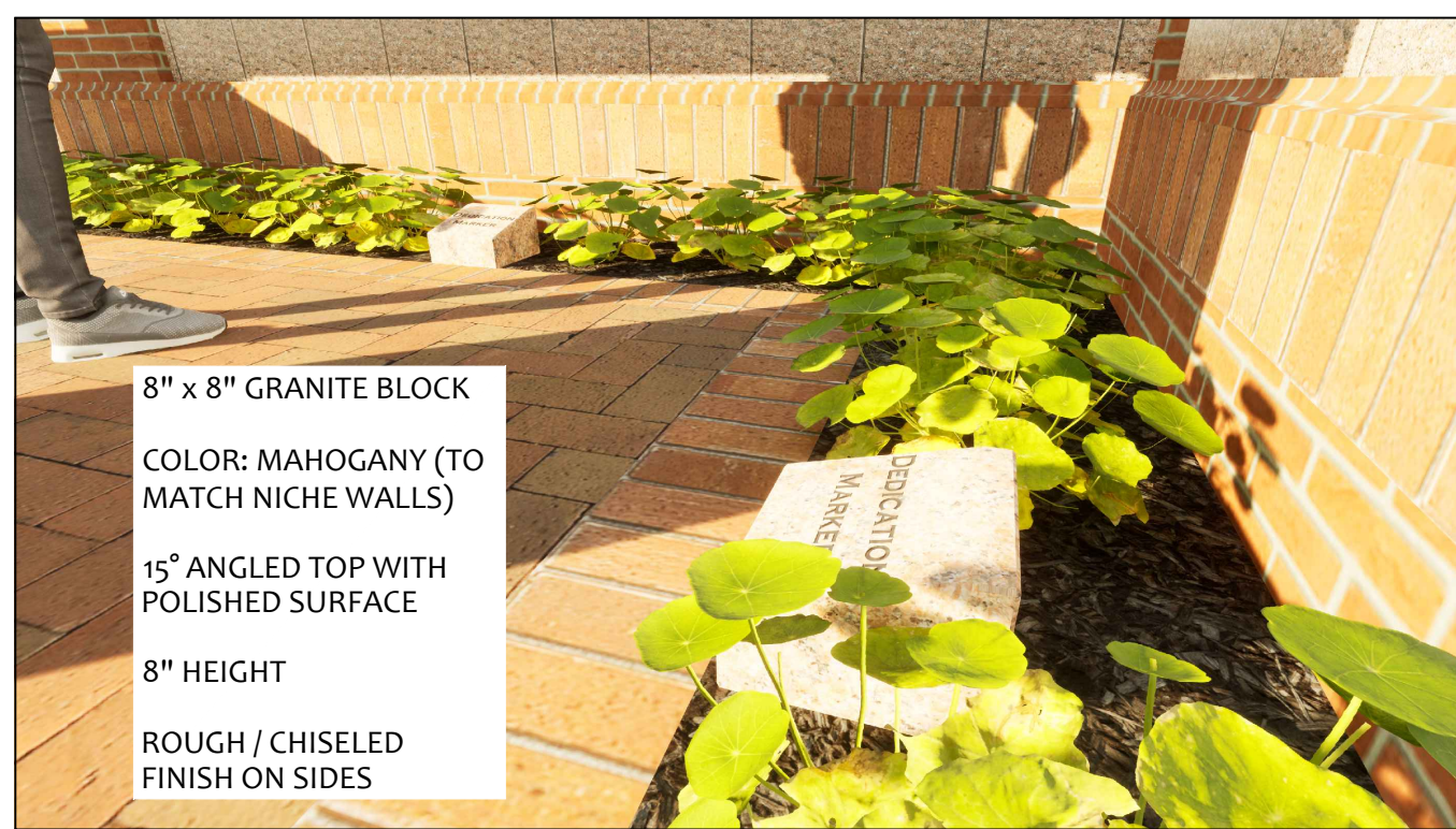
(4) NICHE WALL DEDICATION MARKERS