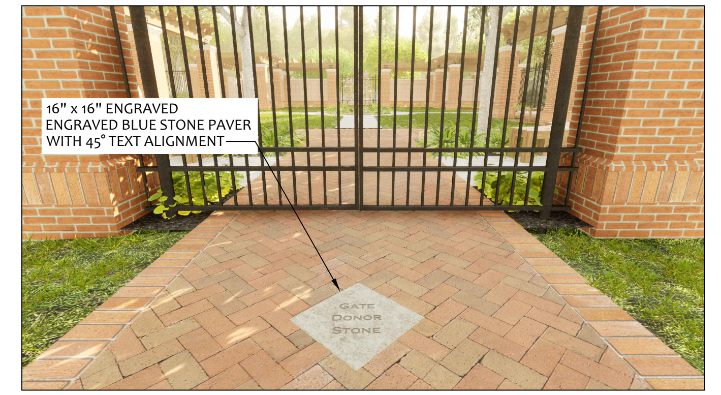
(3) 16"x16" DONOR MARKER AT GATE AND WALKWAYS