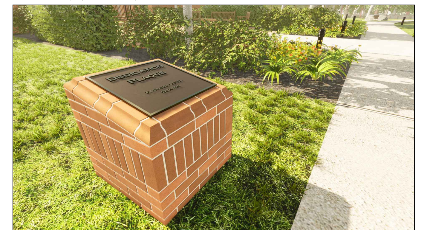
(6) DEDICATION PLAQUE