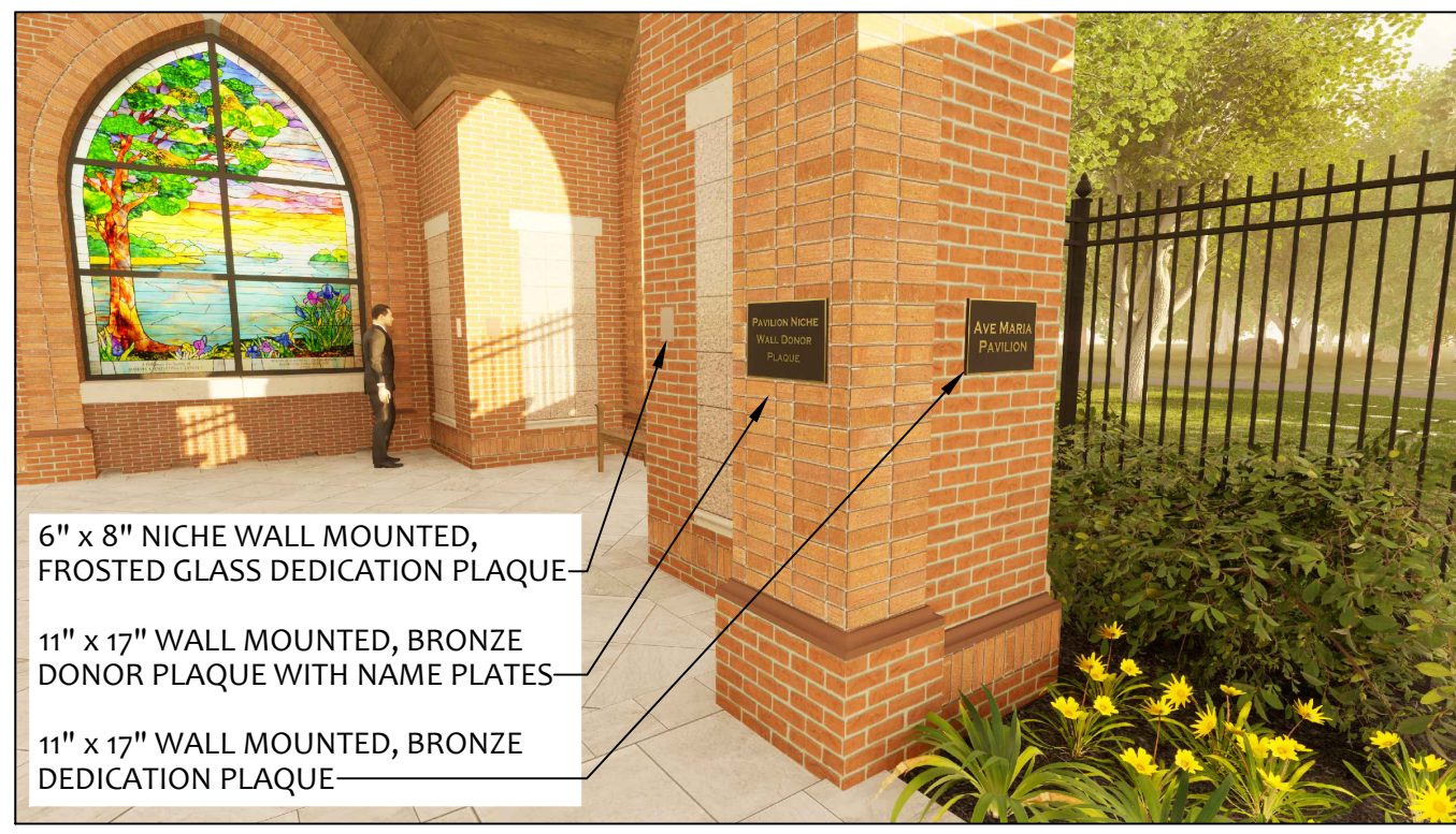
(1) WALL MOUNTED PLAQUES AT PAVILION