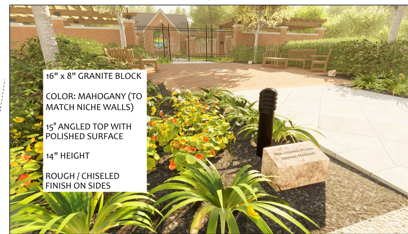
(5) WELCOMING PLAZA DONOR MARKER