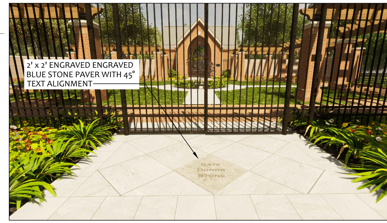
(2) 2' x 2' DONOR MARKER AT GATE AND STATUES