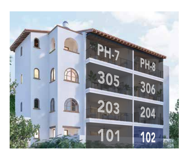
*Estimated HOA fees were calculated based on the total budgeted HOA fees divided by the total sqm per unit.