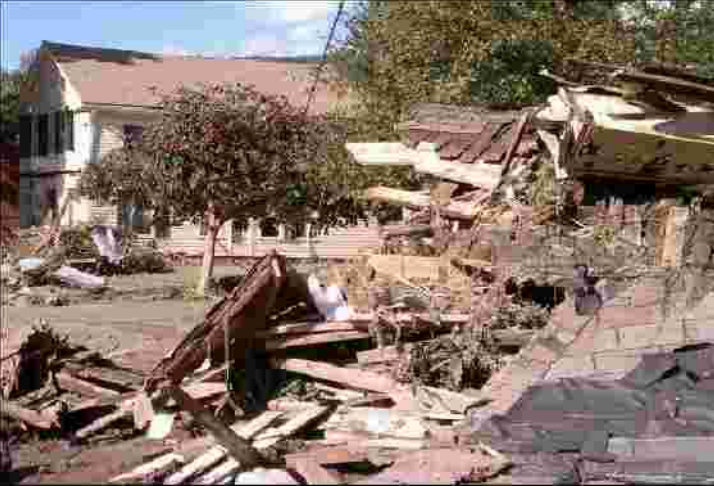
Photo from September 2011 taken in Prattsville, NY