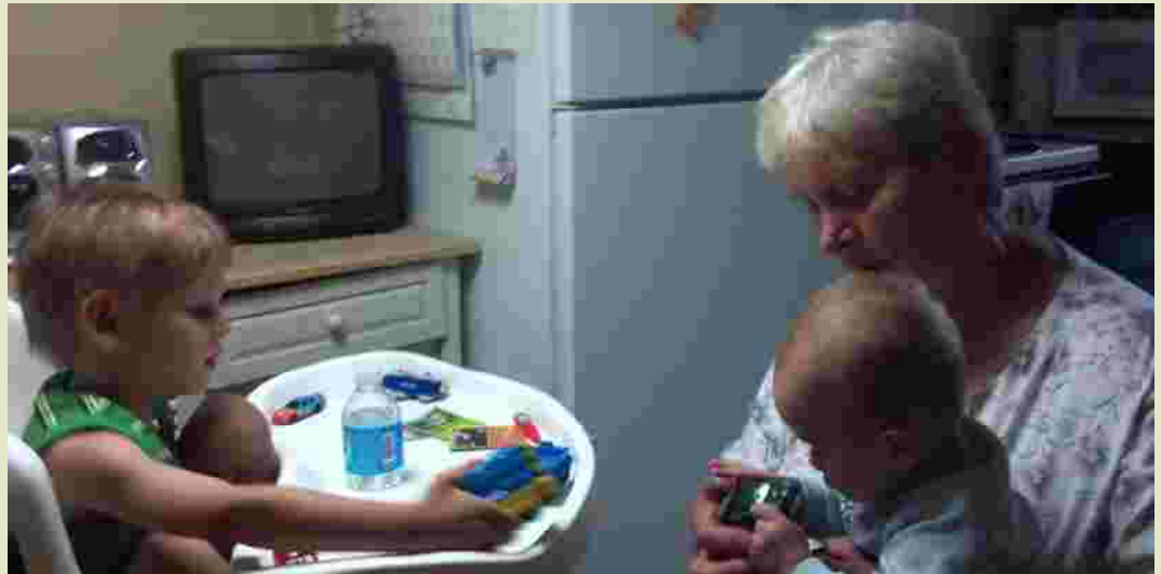
An older woman cares for her two grandsons where the generational differences are large but not outmatched by love. Parenting has evolved over the years and this requires new ways of thinking and doing for some.

uncles, and extended family members, have come forward to raise children whose parents are unable to do so at this time. This act of love is known as Kinship Care. This kind of care helps protect the children and assists in keeping families together. If children cannot stay safely with their parents, other friends and family members can provide a secure and safe environment for these children, as well as helping to maintain their cultural diversity. If not for these Kinship Family members choosing to raise these children, they would most likely end up living in a house with strangers within the formal foster care systems established.