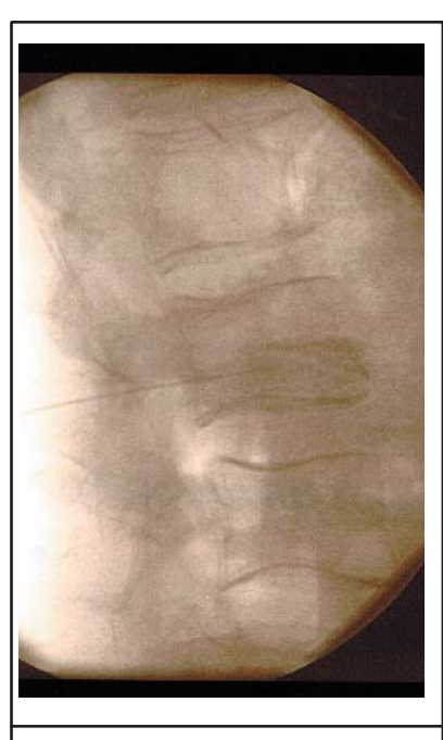
Fig 2. Lateral view of L2 rami communicans RF needle position

radiofrequency lesioning of the lumbar medial branches. She had some modest improvement but continued to require sustained release oxycodone 20 mg BID and hydrocodone/acetaminophen 5/325 3 times a day. She complained of left-sided belt-line pain with minimal radiation to the buttock area and sitting intolerance. Her physical exam revealed mild loss of lumbar lordosis, mild paraspinous muscle tenderness, and a well healed surgical scar. The neurological examination was MRI scanning disclosed non-focal. minimal bulging at L4/L5 and a Concordant laminectomy. previous pain at this level was demonstrated by provocative discography. An L2 ramus communicans block gave her excellent temporary improvement (VAS reduction by 85 %). On stimulation of the ramus communicans, she had reproduction of her low back pain. She subsequently had radiofrequency denervation of this region with 3 months of pain relief. Her sitting intolerance increased from 15 minutes to 43 minutes. Her VAS score was reduced from 7/10 to 3/10. The patient stopped her OxyContin and remained on 2 hydrocodone/ acetaminophen tablets per day. She presented 4 months post-radiofrequency for a repeat L2 communicans denervation