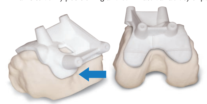
Femoral Pin Guide Anterior ridge stabilizing mechanism on the femur guide ensures a secure fit.

The custom pin guides are designed with position stabilizing features and anatomical reference lines including the transepicondylar, mechanical and AP axis to verify positioning and eliminate variability of placement.