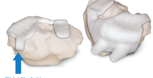
Tibial Pin Guide Posterior hook on the medial side of the tibia guide stabilizes guide and eliminates lateral rotation.