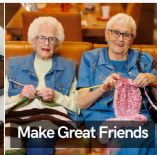
Make Great Friends

4000 James Hill Rd. harbourlandingvillage.ca info@hlvillage.ca