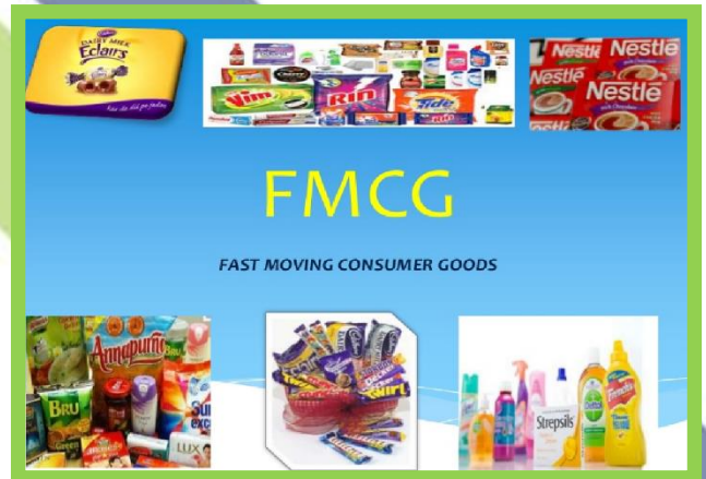
FMCG (Fast Moving Consumer Goods)