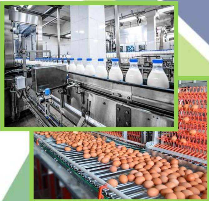
Food & Beverage Sector