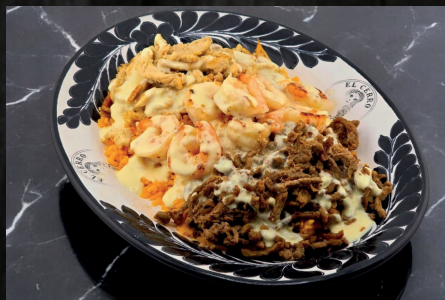
ARROZ CON POLLO TRIO