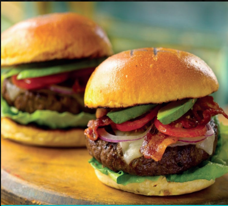
BACON AVOCADO BURGER

Fajita Nachos Nachos with your choice of steak, grilled chicken or chorizo cooked with grilled onions, bell peppers, tomatoes, melted cheese and topped with sour cream salad. 14.00 With shrimp 15.00 Birria Nachos Nachos with beef birria topped with cheese, onions, cilantro, guacamole, sour cream and pico de gallo. Drizzled with chipotle sauce 15.00 Nachos Supreme Served with your choice of pulled chicken or beef topped with our signature cheese sauce, lettuce, sour cream, tomato and pickled jalapeños 14.00 Loaded Nachos Nachos with tender steak, shrimp and chicken, cooked with grilled peppers, onions, tomatoes, topped with our signature cheese sauce, guacamole salad, pico de gallo and pickled jalapeños. 20.00 Cholo Burger Double cheeseburger with grilled onions, jalapeños, cheese, egg over-easy, avocado and chipotle salsa. Served with fries 14.00