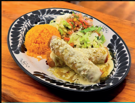
FLAUTAS DE POLLO

1/2 A.C.P. Chicken strips covered with cheese dip. Served with rice 9.50