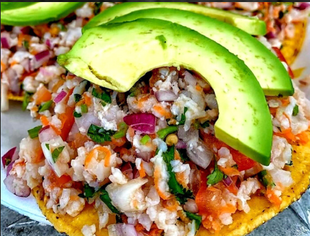
TOSTADA DE CEVICHE

Street Corn Tacos (3) Vegetariano 3 tacos with black beans, roasted corn, poblano peppers, and red onion topped with pico de gallo, chili lime, mayonnaise, and queso fresco. Served with rice and beans 14.00