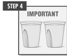
You MUST drink two more 16-ounce containers of water over the next hour.