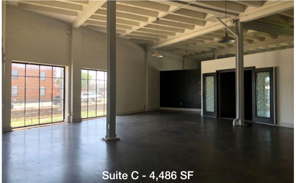
Suite C - 4,486 SF