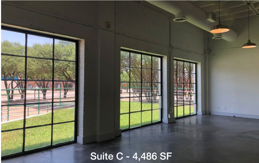
Suite C - 4,486 SF