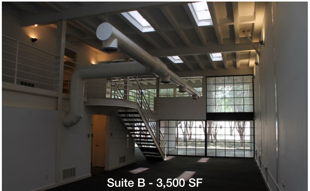
Suite B - 3,500 SF