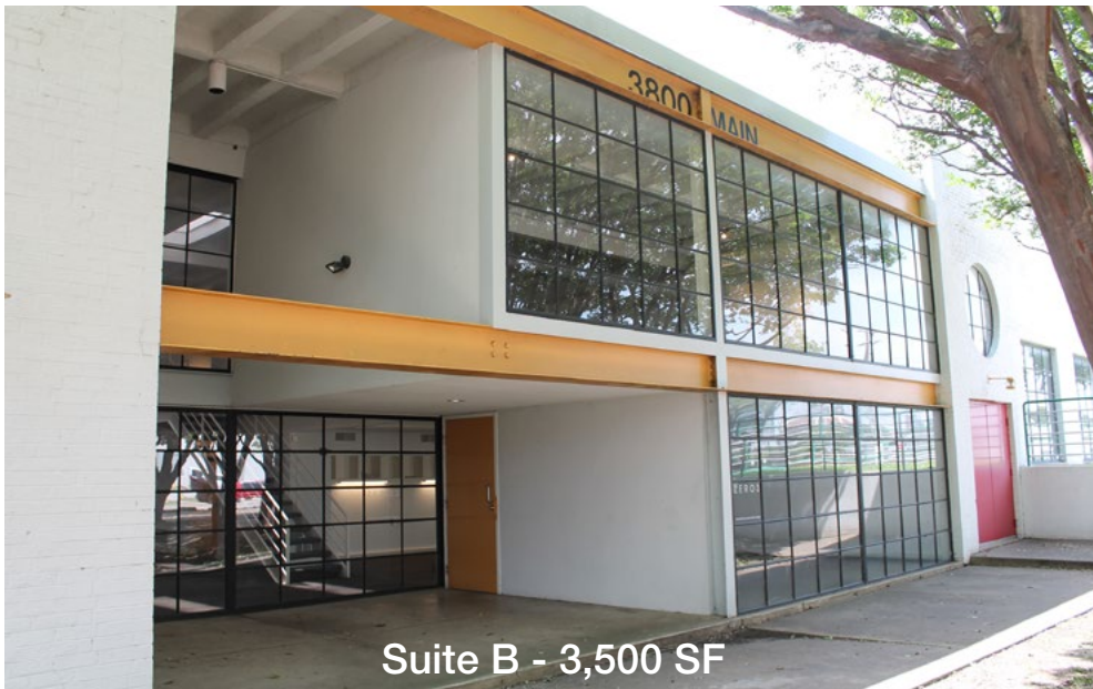
Suite B - 3,500 SF